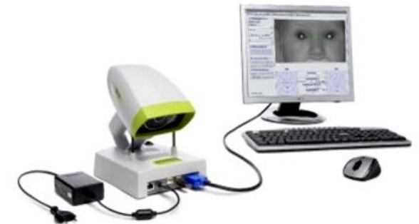
PlusOptix S09 System

The screening process is non-invasive, simple and quick. The child's head is placed in front of the PlusOptix S09 camera and a digital picture is taken. The pictures are evaluated real-time to determine if there may be a vision problem.